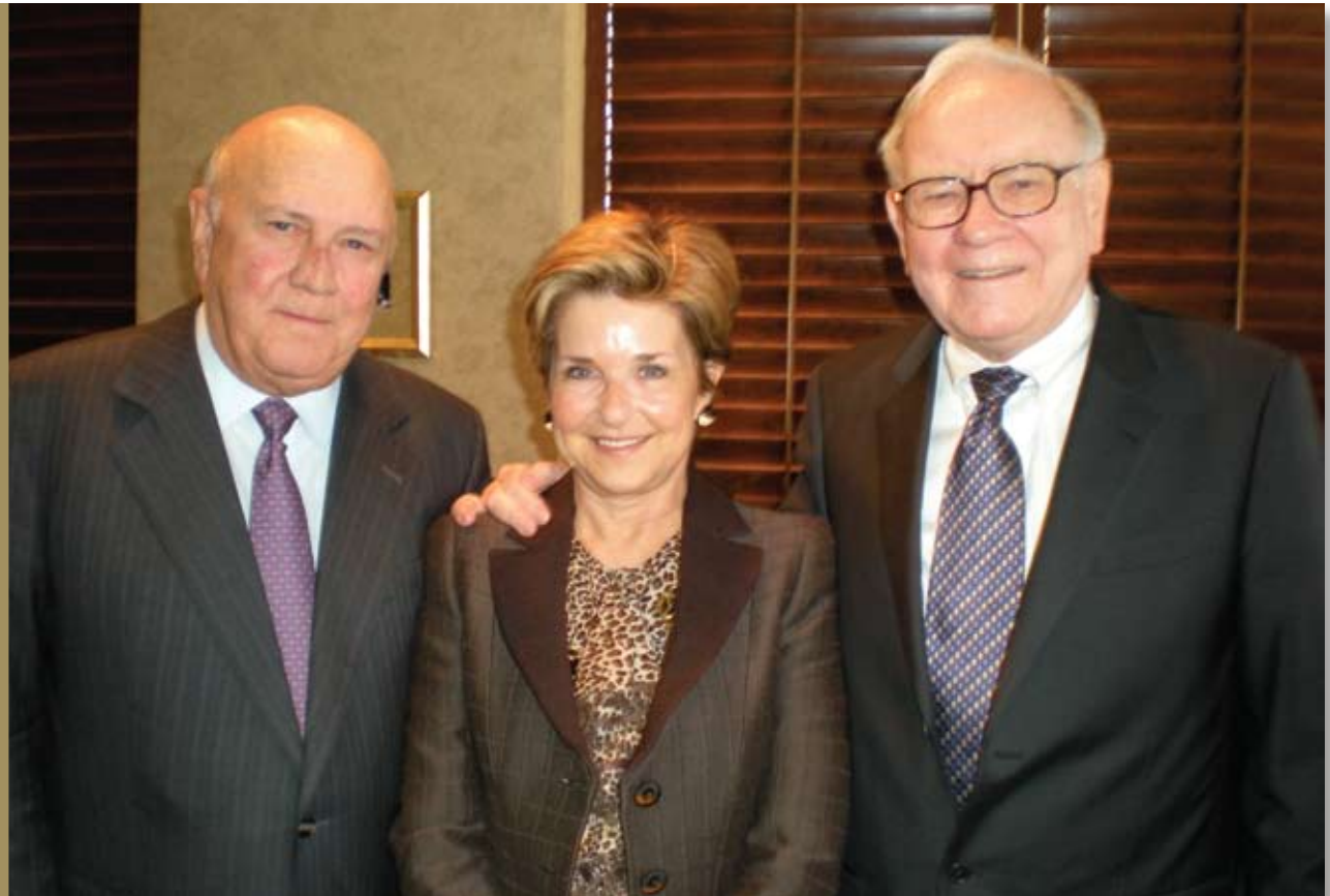
▲ FW and Elita de Klerk with Warren Buffet during their meeting in February .