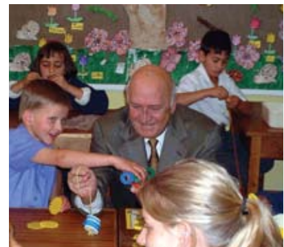
▲ FW de Klerk with a learner from the Alta du Toit School.

The Board of Trustees held meetings at the Cape Town Club on 29 February 2008 and at the Wanderers Club, Johannesburg, on 26 September 2008.