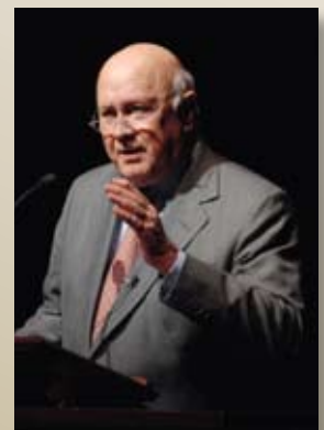
▼ FW de Klerk delivering his speech at Elizabeth College, Pennsylvania.