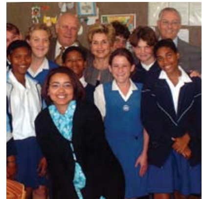
▲ The FW de Klerk Foundation made a donation of R 74 000 to the Alta du Toit Aftercare Centre, from funds raised at the SA Golf Day.